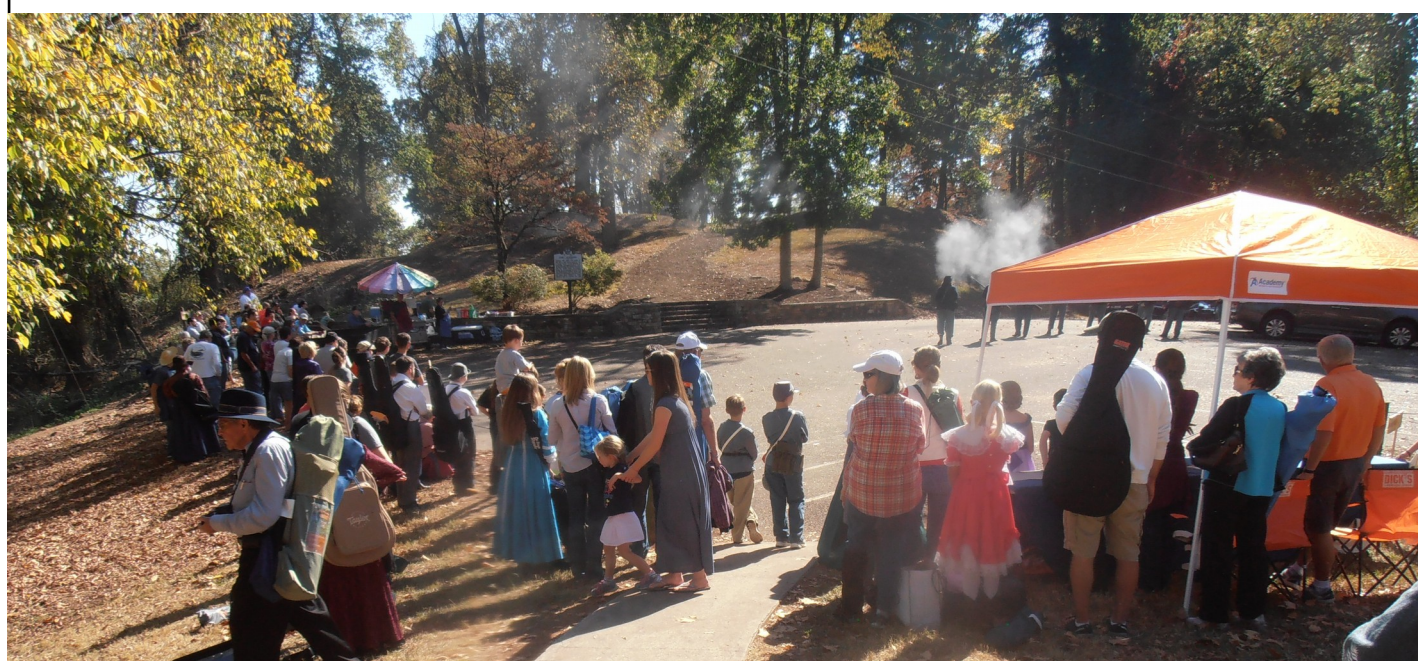
The crowd watching a battle between Union and Confederate troops